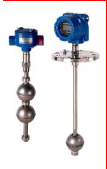
Standard KSR Kuebler Units

The above standard features allow you to select a model that best suits your process control needs, directly from this technical guide.